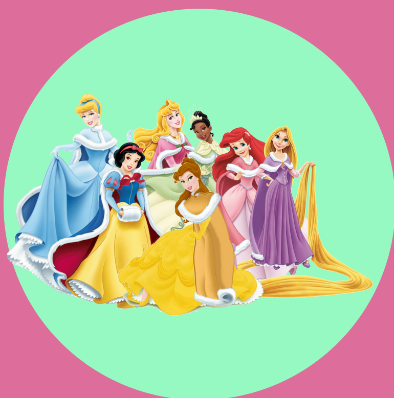
PRINCESS/PRINCE JULY 8-12 9:45-11:15AM