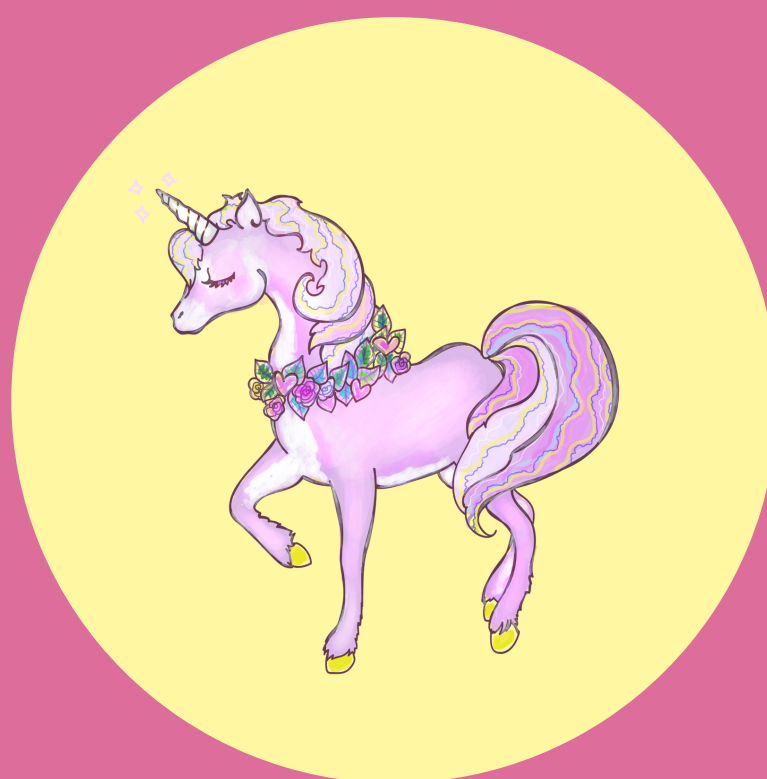
UNICORN, RAINBOW & SPARKLES JULY 15-19 9:45-11:15AM