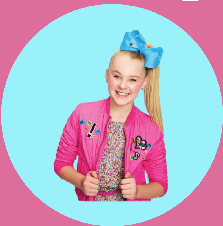
JOJO SIWA JULY 8-12 11:30-2PM