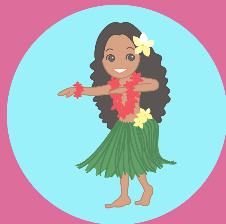
ISLAND LUAU JULY 22-26 9:45-11:15AM