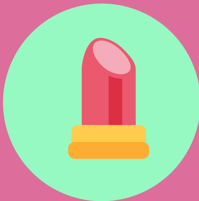
BALLERINA BOUTIQUE JULY 15-19 11:30-2PM